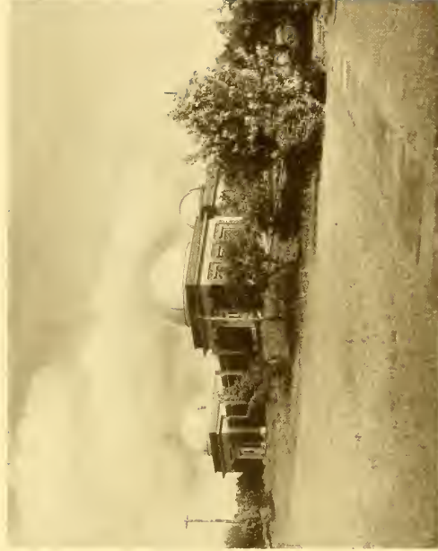
THE FUERTES OBSERVATORY